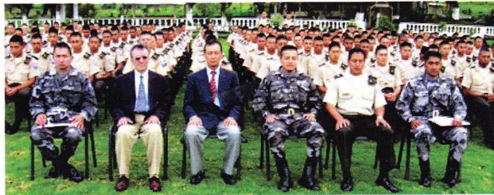
Military personnel in Latin America, Africa and Asia practice group Transcendental Meditation to help protect their nations

Experience with IDT in other war-torn nations demonstrated increases in economic incentive and growth. Entrepreneurship and individual creativity also increased. With increased civic calm, people's aspirations are raised and a more productive and balanced society emerges. Such a society abhors violence as a means for change or as an expression of discontent. With this, the ground for terrorism is eliminated. What is more fascinating, this change takes place within a few