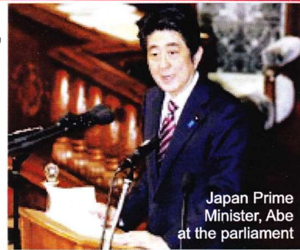
Japan Prime Minister, Abe at the parliament

IDT defense technology supersedes all other known defense technologies (which are based on electronic, chemical, and/or nuclear forces). These old, fear-based modalities are ultimately self-destructive for any nation, and for the human race as a whole, and must be replaced with IDT. So far, IDT is the only known, proven constructive approach.